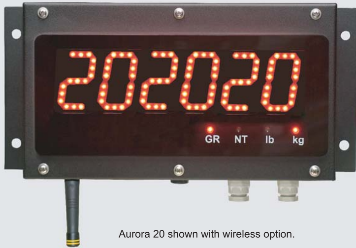
Aurora 20 shown with wireless option.