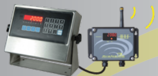
SCALE TO REMOTE DISPLAY