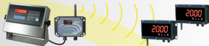
SCALE TO MULTIPLE REMOTE DISPLAYS