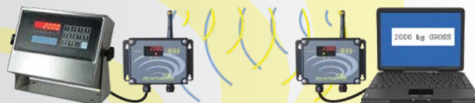
SCALE TO PC (1 OR 2 WAY COMMUNICATION)

* 2 ScaleLinks required for wireless communication between devices.